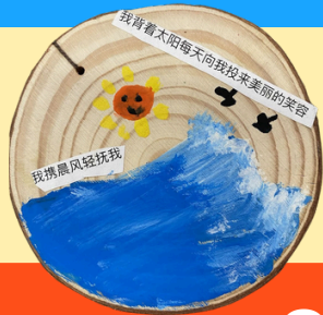
Student poetry mobile from a poetry & visual arts residency at P.S. 2, Manhattan

Education is core to City Lore's mission of advancing cultural equity. We bring a uniquely cultural and decolonial lens to arts education by centering culturally-rooted arts, including folk and traditional arts and artists, in meaningful ways that connect to young people's own heritages, identities, experiences, and communities.